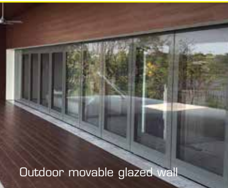
Outdoor movable glazed wall

By using a Transpalace partition, you create an open and bright environment, while retaining high acoustic insulation and the contemporary functional design.