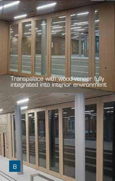
Transpalace with wood-veneer fully integrated into interior environment