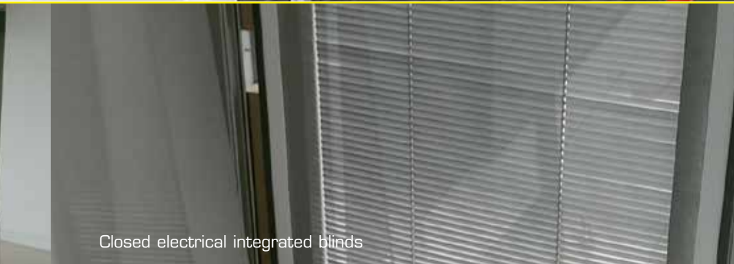
Closed electrical integrated blinds