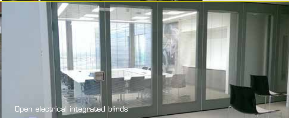
Open electrical integrated blinds