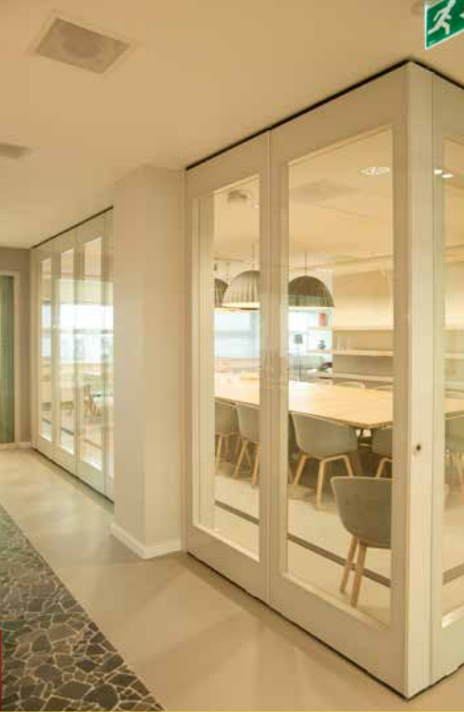
DOUBLE GLAZED ACOUSTIC MOVABLE WALLS